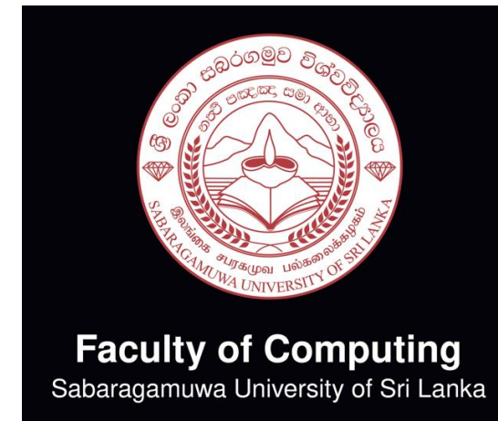
Figure 4: Reversed Version of Stacked Version