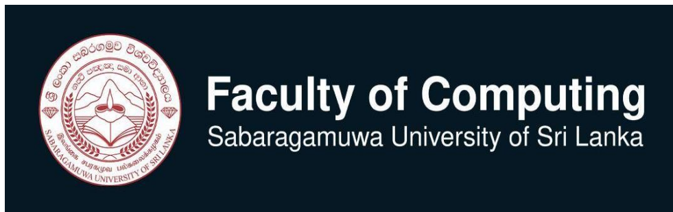
Figure 3: Reversed Version of Primary Logo